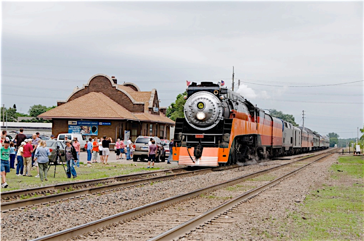
Southern Pacific 4449 brings its train into St. Cloud, MN July 16th.

This issue is an abbreviated edition as the editor is working for the NRHS Duluth Convention.