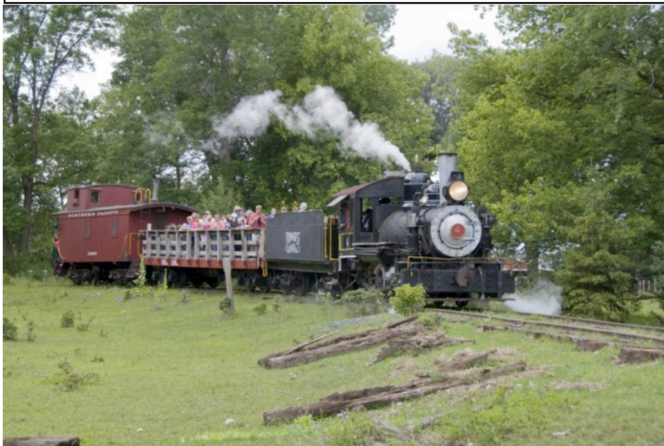
Steam up on the Ironhorse Central August 1st, site of the Northstar Chapter picnic.