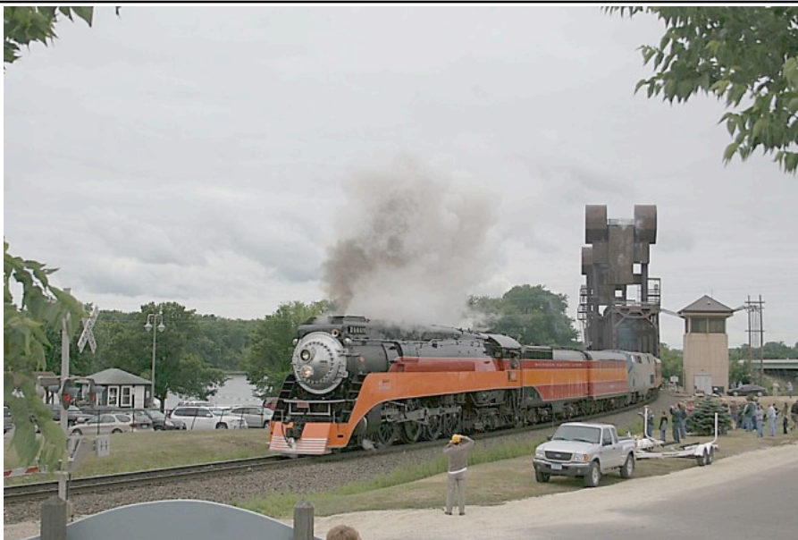
4449 on its way to Chicago via the BNSF July 19th.