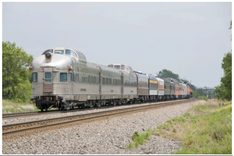
Left: 4449 from the Soo Line Soo Line Trail Overpass July 16th. Right: 4449 and train passing Big Lake.