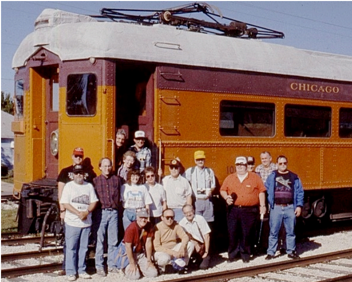
September 17, 1994 we took a trip to see the Chinese steam locomotive at the Boone and Scenic Railroad. A ride on a former Chicago South Shore and South Bend car was also included.