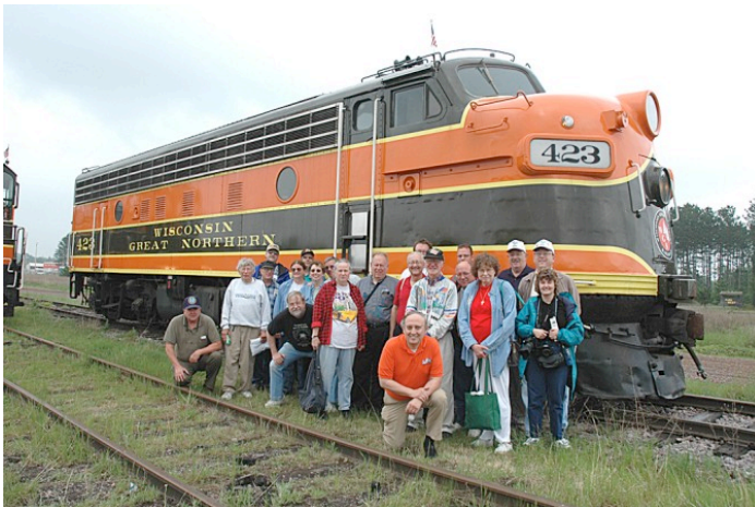
June 2005 we rode a passenger extra on the Wisconsin Great Northern at Spooner, WI. Also included was a visit to the Railroad Memories Museum in the former Omaha Road Spooner Depot.