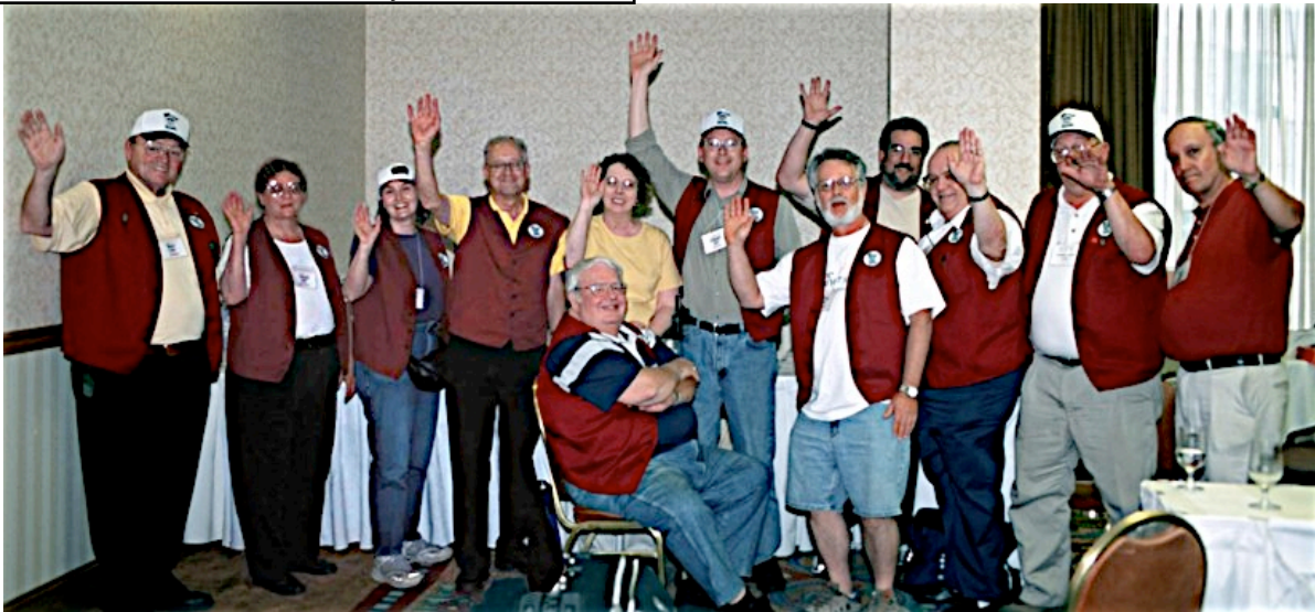
In July 2004 we sponsored the National NRHS Convention. On completion of the last event, a special on the Osceola and St. Croix Valley Railroad, and having everyone delivered to the airport on time, you see here a very tired, but relieved convention committee.