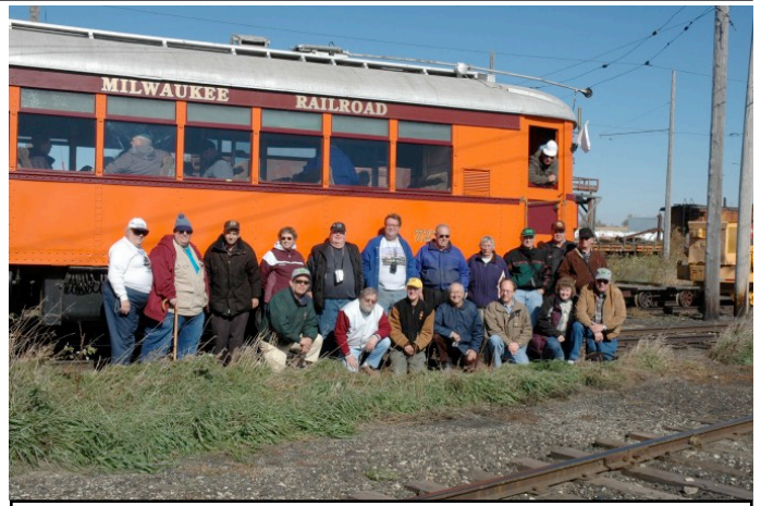
October 14, 2006 we joined Iowa Chapter members in a tour of the Iowa Traction Railroad aboard Chicago North Shore and Milwaukee interurban #727.