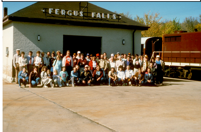
October 1, 1988 we sponsored a passenger extra over the Otter Tail Railroad from Avon to Fergus Falls, MN.