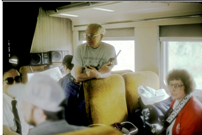
June 7, 1992 we see members enjoying the ride on the Algoma Central.