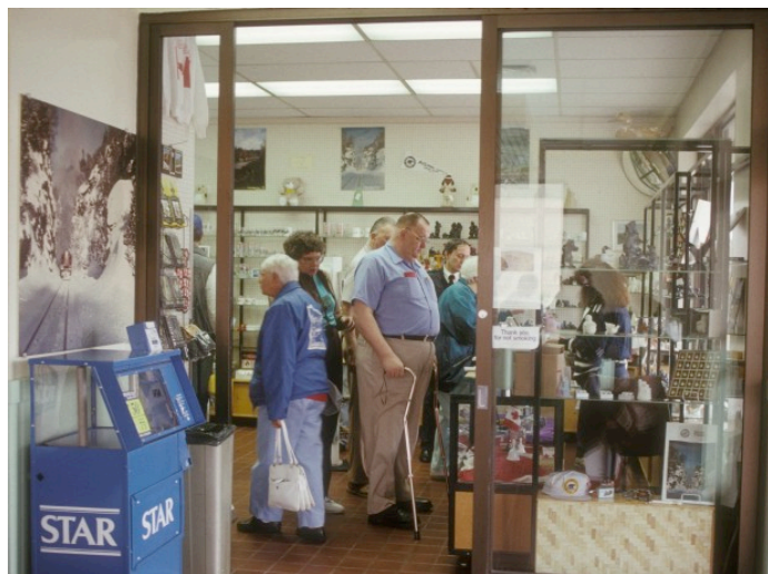
June 7, 1992 the chapter rode the Algoma Central. Here we see members at the gift shop in the Sault Sainte Marie, Ontario station.