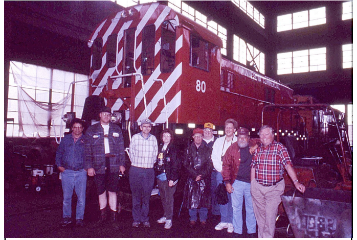
June 6, 1998 we toured the Minnesota Commercial round house.