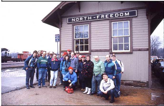
February 19, 1994 we headed over to the Mid-Continent Railway Museum at North Freedom, WI to ride their "Snow Train." Unfortunately a thaw made it the "mud Train."