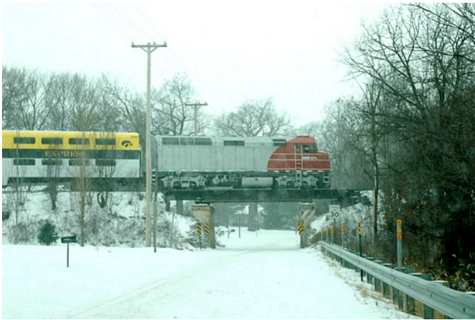
The Manly Junction Railway Museum Special approaching Rock Falls, IA, December 1.