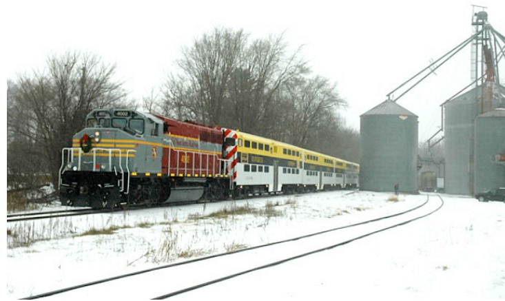
Center picture: Near Plymouth Junction. Right: Loading at Manly. Bottom: At Rock Falls.