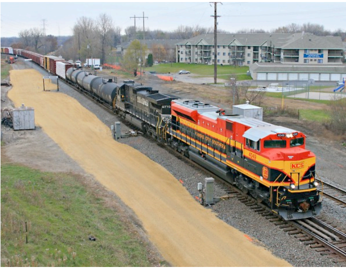
Train H-PASIH B Pasco to the Indiana Harbor Belt passes through Anoka November 9th with a new Kansas City Southern SD-70ACe in the lead followed by a Norfolk Southern C40-9.