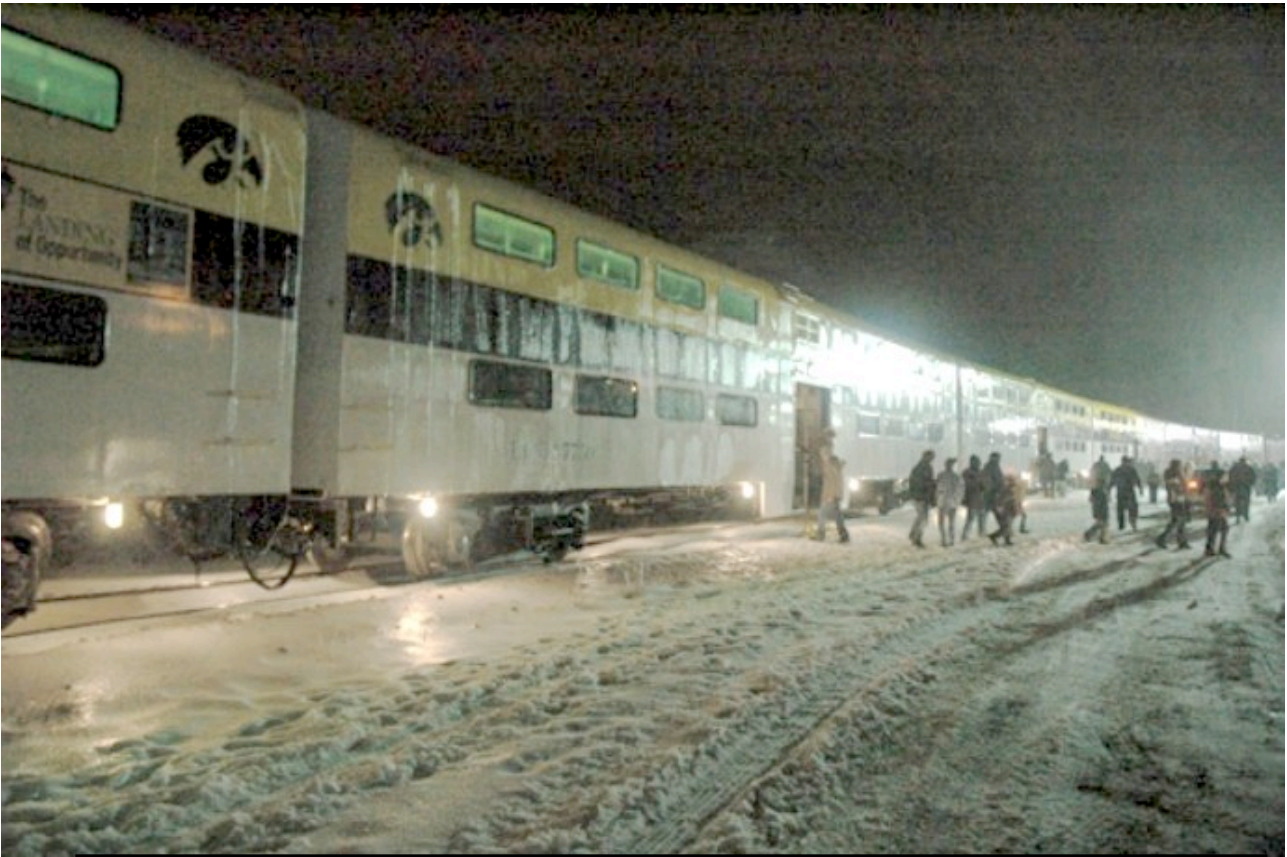
Top: A the end of the run at Rock Falls, IA showing Iowa Northern power. Bottom: End of the last run at Manly, IA. These are former Chicago Metra, former Chicago and North Western coaches.