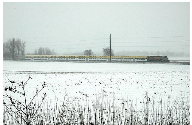
The Holiday Hawkeye Express near Plymouth Junction.

The Holiday Hawkeye Express equipment was former Chicago Metra commuter gallery cars with limited restroom facilities and walkover bench seats. Dawn reported that she had heard that approximately 800 had ridden each run.