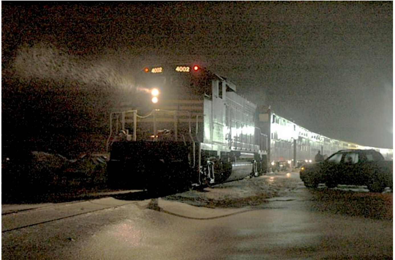
Saturday, December 1st, Iowa Northern 4002 heads up a brace of former Metra gallery commuter cars at the end of the 4pm trip between Manly, Iowa and Rock Falls, Iowa for the benefit of the Manly Junction Railroad Museum. See page 7.

Dues ARE Due NOW. Please send in the invoice you received in the mail.