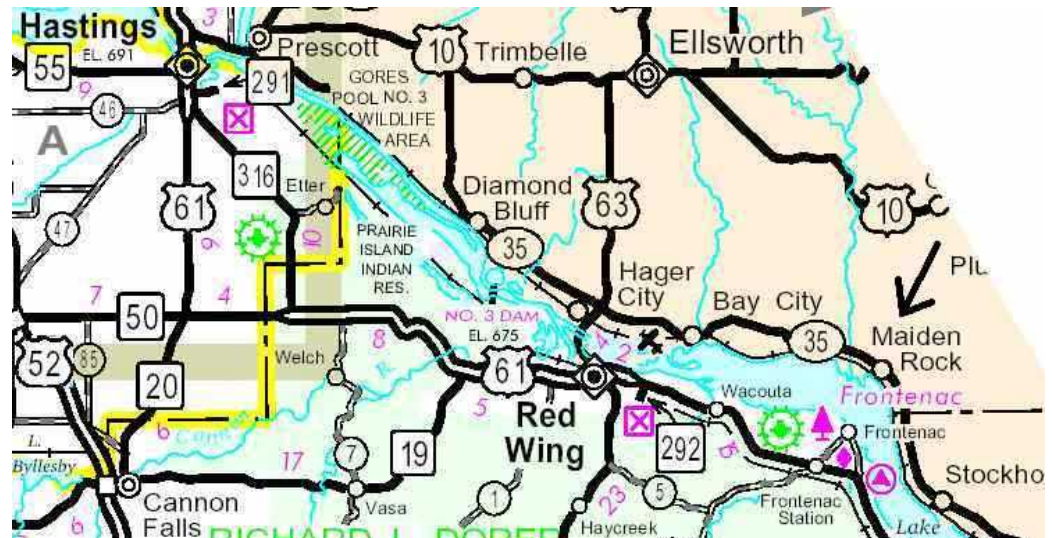
Map of various ways to get to Veteran's Park in Maiden Rock, Wisc.