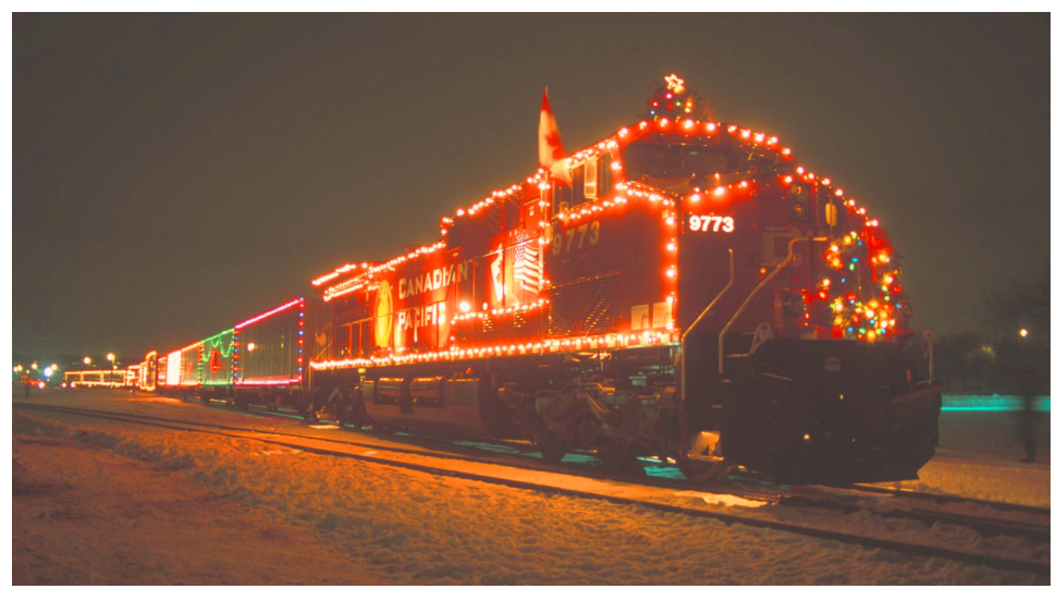
CP Rail Holiday Train, Shoreham