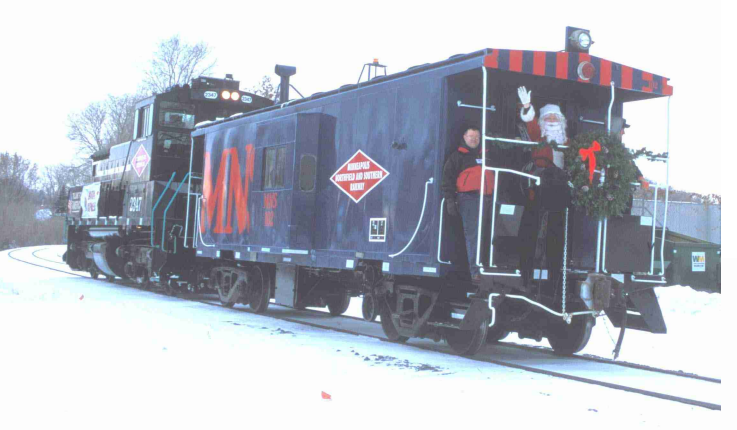
Progressive Rail Santa's Express, Bloomington