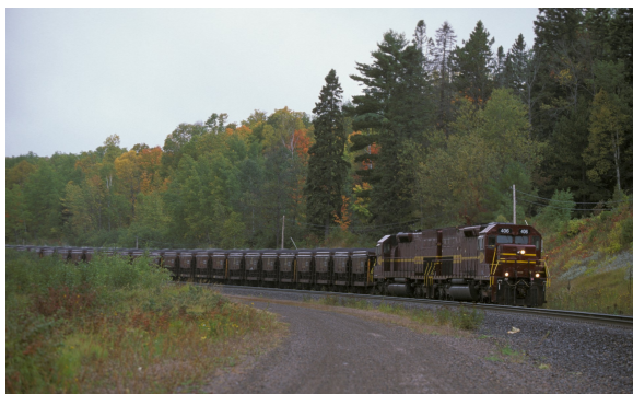
406 Highland Lake, South of Wales.