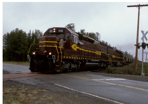
415 crossing County Road 19, East of Ramshaw.